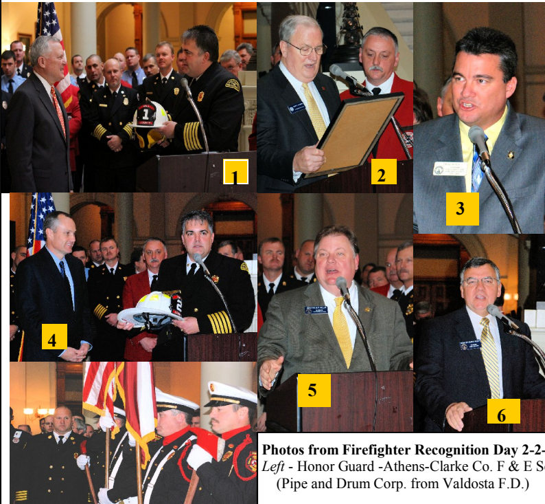
Photos from Firefighter Recognition Day 2-2-11 Left - Honor Guard -Athens-Clarke Co. F & E Serv. (Pipe and Drum Corp. from Valdosta F.D.)

1. Gov. Deal, 2. Ins.& Safety Fire Comm. Hudgens, 3. Rep. Bearden, Chair, Public Safety & H.L. Security, 4. Lt. Gov. Cagle, 5. Senator Mullis, Public Safety Ex-Officio, 6. Senator Grant, Public Safety.