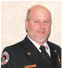
President Craig Tully

If I was in a humorous mood, which I'm not, this month's article would go something like this: Let's stop all our efforts to prevent fires. Let's support a new move to have anti-sprinkler advocates take control of fire codes and let them push all their combustible building materials on residential and commercial building occupants. Georgia will save a ton of money by eliminating: fire codes, all our Fire Marshals, firefighter training and gasoline for fire trucks. And think about all that water we'll save. Prevention? Too expensive!